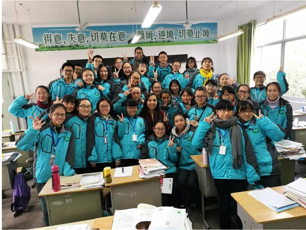
(Classroom 204 some of the most amazing students)

I made the decision to come to China to get a glimpse of the Chinese lifestyle and culture. I also had a strong desire to work with Chinese high school students in order to cultivate international exchange and communication. I can't describe how happy I have been since my arrival!