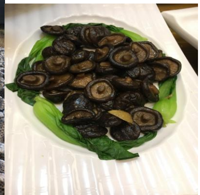
(Left: A picture of me surrounded by a wonderful mushroom field in Qingyuan; Right: cooked mushrooms)