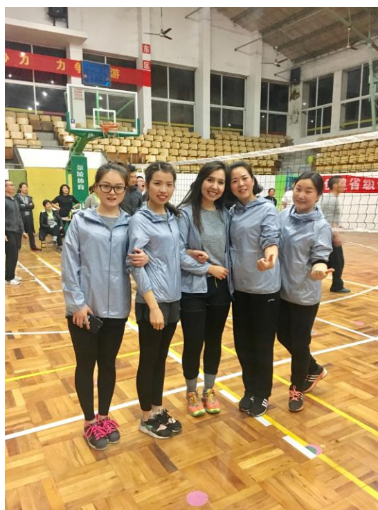
(Some of my volleyball teammates and I before our first league game)