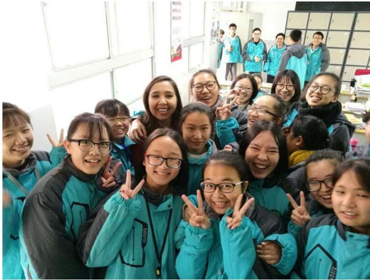
(Great moments of laughter with my students)