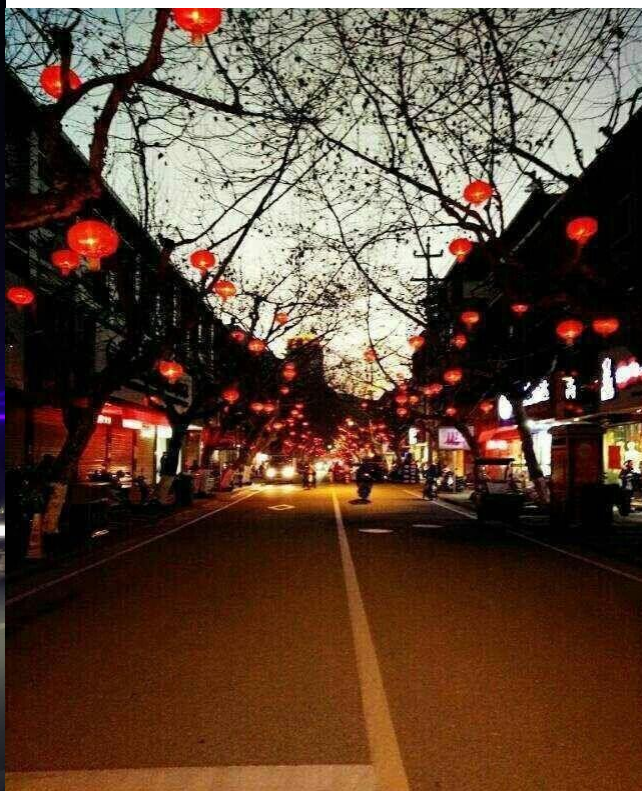
(Qingyuan during the night)