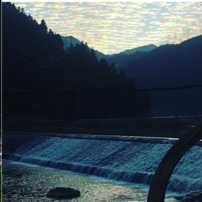
(Qingyuan during the day)