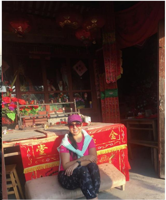
(Left: My two friends at the peak of Xun Shan 熏山 Mountain; Right: The Ancient Xun Shan 熏山 Temple)

Qingyuan also known as mushroom town (香菇 Xiang gu) is the third leading county in mushroom cultivation across all of China. In the States I never ate mushrooms because I found it disgusting but somehow I have grown to love mushrooms and eat them almost every day. The way the people in Qingyuan cook mushrooms is far more delicious than the way they cook them in America. Another one of my absolute favorite meals in Qingyuan is huang guo 黄粿. Huang guo is like a rice patty, thick in texture and very chewy. It is so satisfying to the taste buds! Back home there are many misconceptions of what traditional Chinese food looks or tastes like but those misconceptions do not apply to the food in Qingyuan. Beyond the amazing cuisine and specialty foods in Qingyuan, it is very easy to make friends!