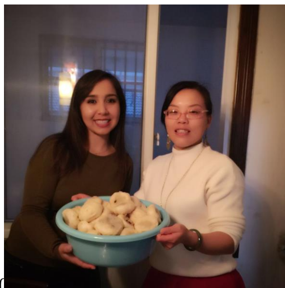
(Preparing baozi for dinner with great friends)