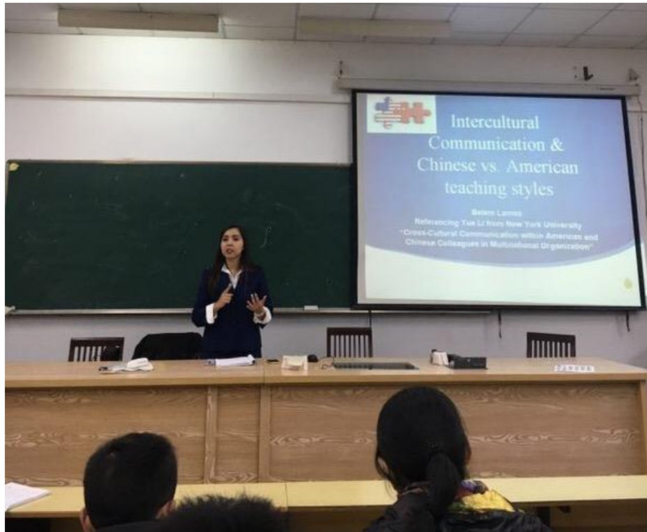
(Giving a Lecture on Intercultural Communication for Qingyuan High School Chinese English teachers)

The people of Qingyuan are extremely hospitable and the kindest people I've met since my twenty-six years of life on planet earth. It may sound a bit exaggerated but I promise you this is the plain truth. It has been such a humbling experience to live here and co-exist with this wonderful community. The opportunity to teach, live, and learn in China has been an unforgettable one. I will always cherish this life-changing experience!