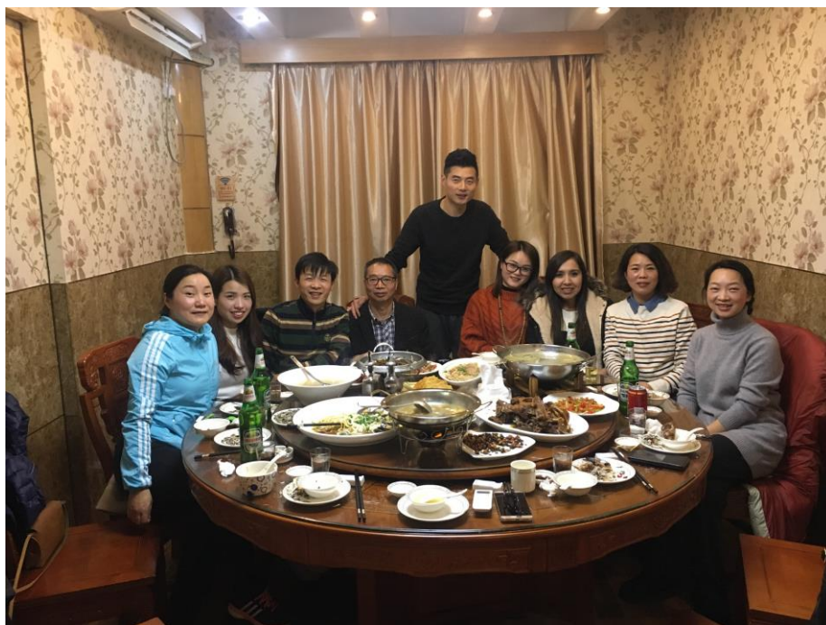
(Most of my volleyball teammates and I at our first team dinner together)

The rest of the community has also been very kind and helpful. After a month of living in Qingyuan they invited me to join their co-ed volleyball club. At first I started off just practicing Mondays, Wednesdays, and Saturdays but now I am part of the “Bulls” team. The league has officially started and we are now competing with other teams. When I play volleyball I use a lot of body language to communicate with my team members (since my Chinese is very poor). Sometimes I’m frustrated with my poor Chinese-speaking skills, however, the people are patient and we always end up understanding one another. I tend to leave applications like Pleco or Baidu as my last resort for communication. I dislike depending on applications for communication but sometimes they come in handy!