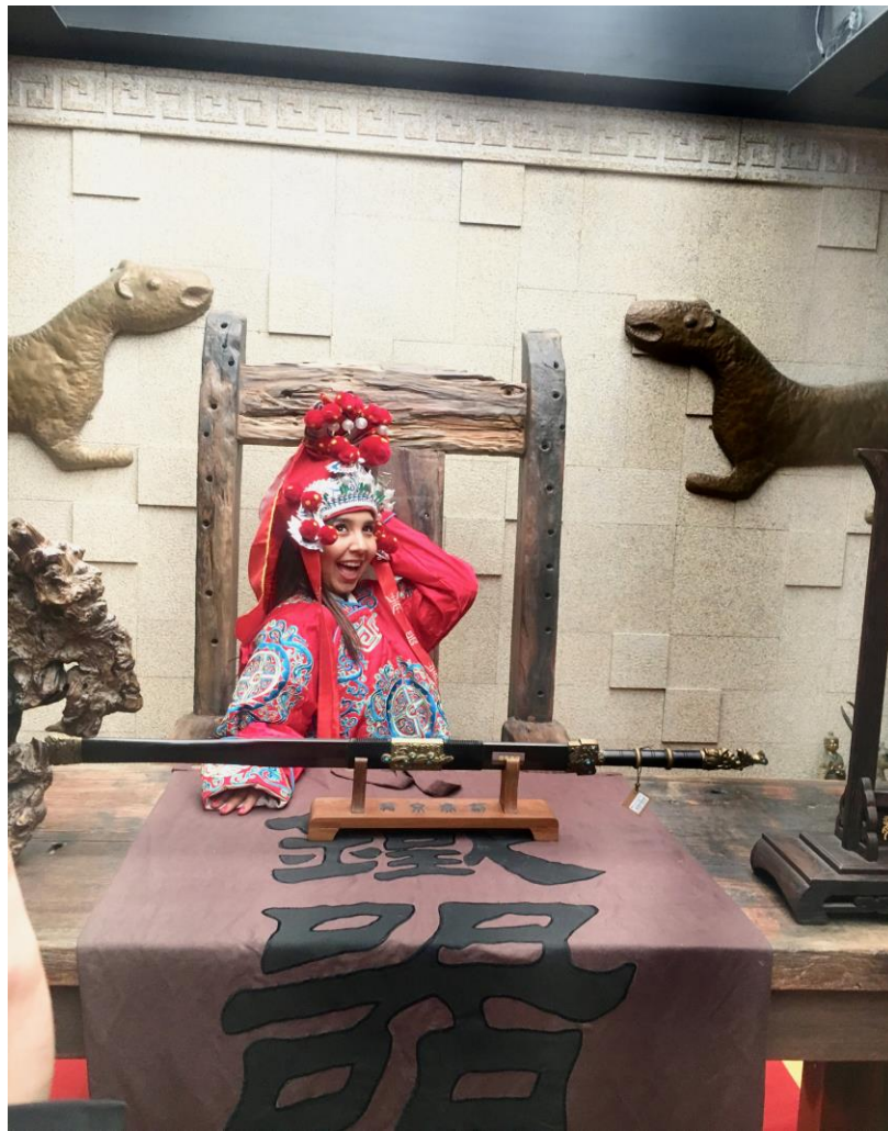
(In Longquan's sword factory wearing traditional Chinese clothing and striking my best pose)