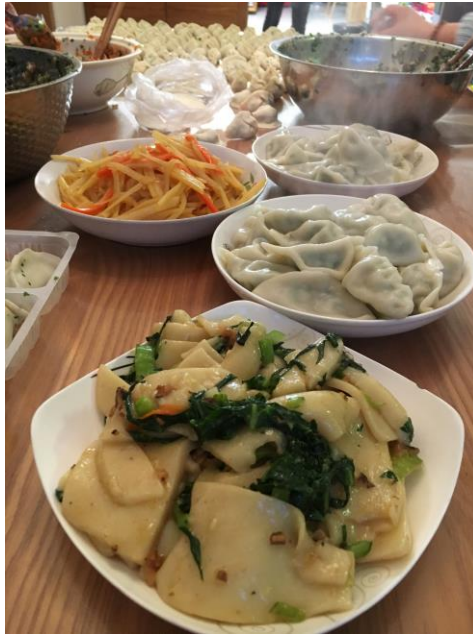
(Scrumptious Huang guo mixed with green vegetables next to other delicious dishes)

The people of Qingyuan are eager to make foreign friends and their curiosity of the American culture is immense! When shopping in the market I feel like a celebrity! Many locals ask me to take pictures with them, which I find hilarious because back in the States only close friends would want a picture with me. It is flattering that they want a picture with me even though I am not in my best clothes ninety percent of the time. However, most of the time I look flawless in their pictures because they use the popular “Snow” application to filter my face and beautify me!